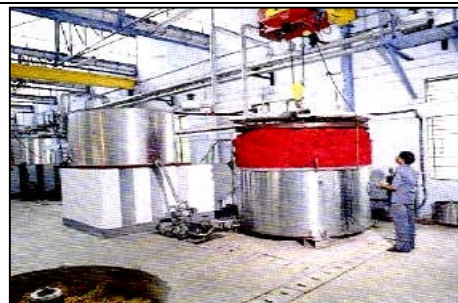
Modern Dye House