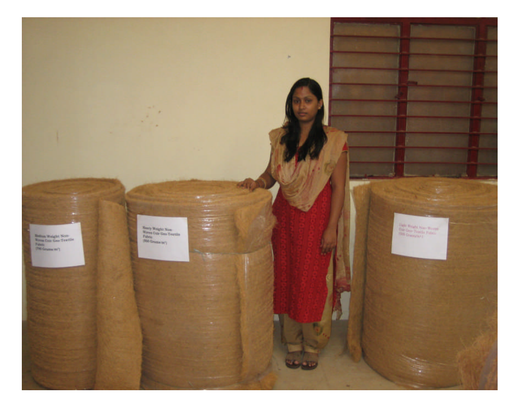
Fig: 4 Light, Heavy Weight Coir Geo-Textile

Fig: 3 Heavy Weight Non-Woven Coir Geo-Textile Fabric (950 g/m<sup>2</sup>)