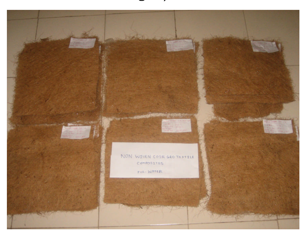
Fig: 7 Heavy Weight Non-Woven Coir Geo-Textiles Composite (950 g/m^2 )