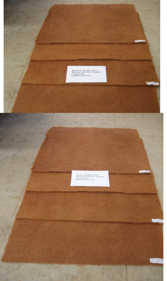
Fig: 6 Weight Coir Geo-Composite

Fig: 5 Light Weight Non-Woven Coir Geo-Textiles Composite (500