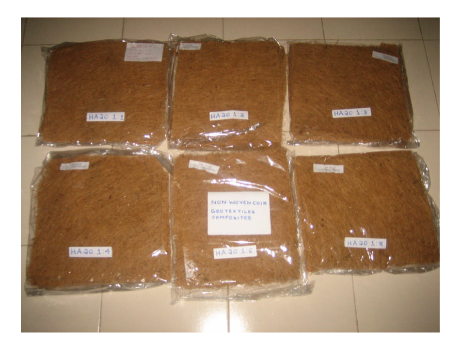
Fig: 11 Light, Medium and Heavy weight Non-Woven Coir Geo-Textiles Composite with HA 20 1:1 to 1:8

Fig: 10 Light, Medium and Heavy weight Non-Woven Coir Geo-Textiles Composite with HA 16 1:1 to 1:8